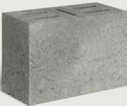
Render Brick Twin Height 1/2 Breaker 230 x 110 x 162mm