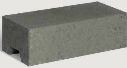
Render Brick Single Height Common Brick 230 x 110 x 76mm