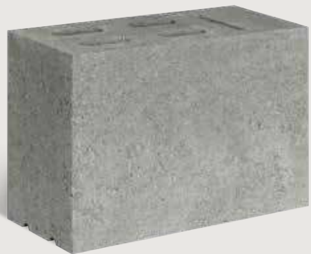
Render Brick Twin Height 3/4 Breaker 230 x 110 x 162mm