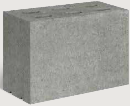
Render Brick Twin Height Standard 230 x 110 x 162mm