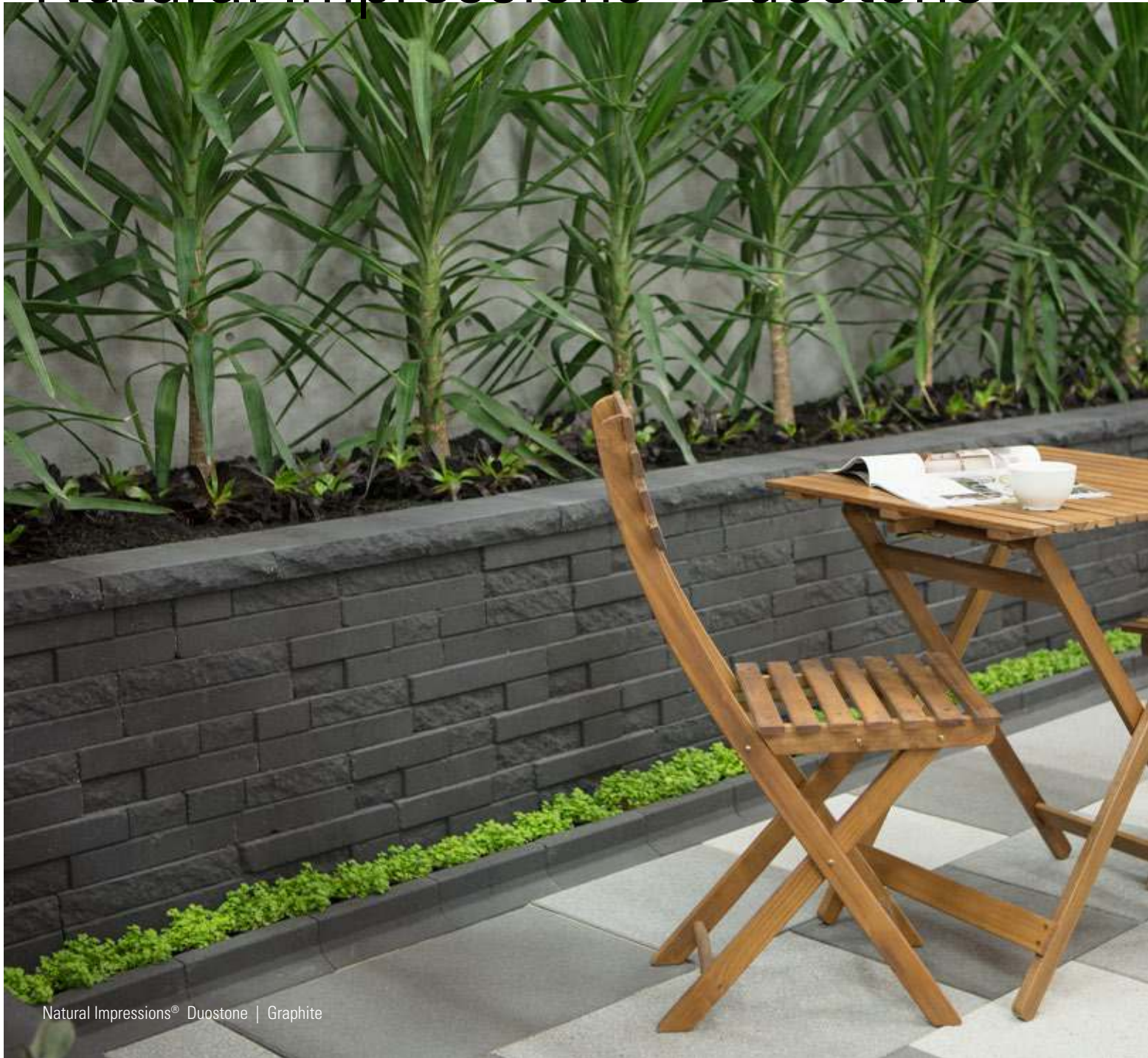
Natural Impressions® Duostone | Graphite