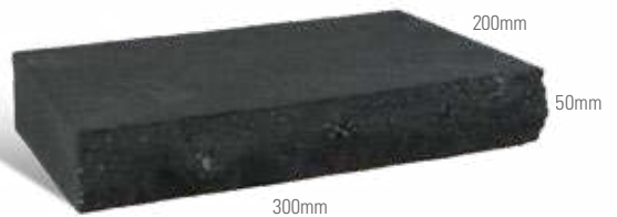
Natural Impressions® Duostone Cap 3.33 units per m 2

Maximum unreinforced height 700mm plus cap (7 courses)