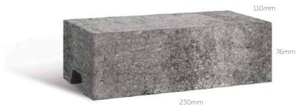
Blended Brick 52 units per m 2