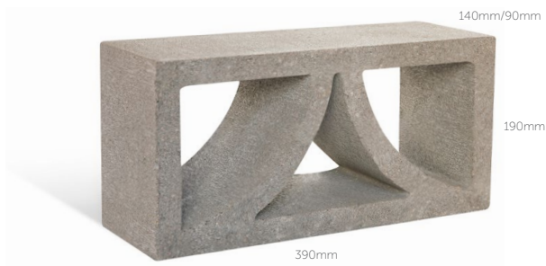
Accent 12.5 units per m 2