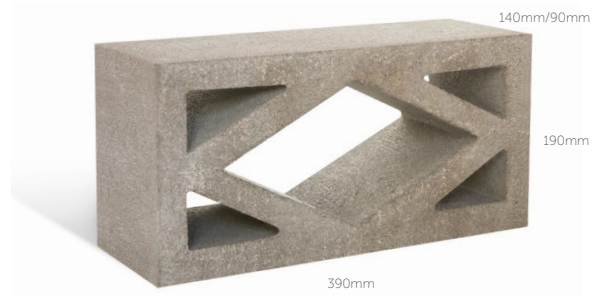
Diamond 12.5 units per m 2