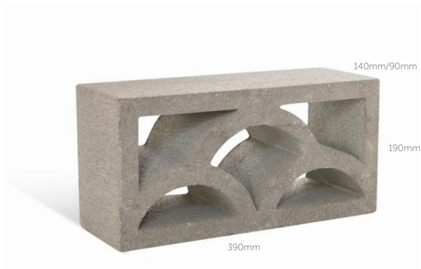
Arches 12.5 units per m 2