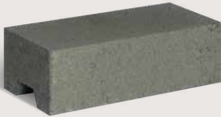
Render Brick Single Height Common Brick 230 x 110 x 76mm