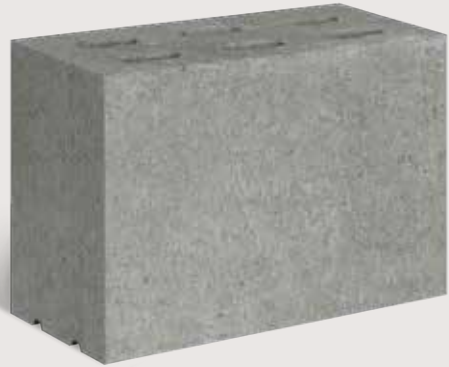
Render Brick Twin Height Standard 230 x 110 x 162mm