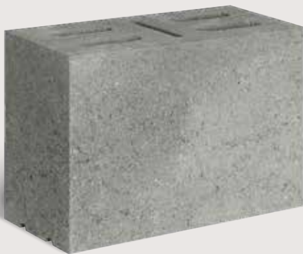
Render Brick Twin Height 1/2 Breaker 230 x 110 x 162mm