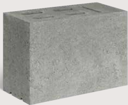
Render Brick Twin Height 3/4 Breaker 230 x 110 x 162mm