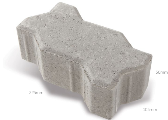
Unipave®50 43 units per m 2