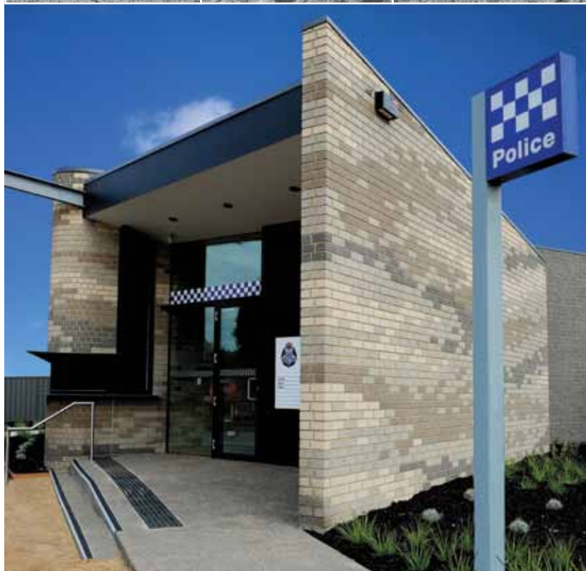
The Axdale Police Station used 15,000 of Adbri Masonry's Coloured Architectural Bricks in both honed and shotblast finishes.

To request your own brick sample pack call 1300 365 565 or email us at enquiries@adbrimasonry.com.au